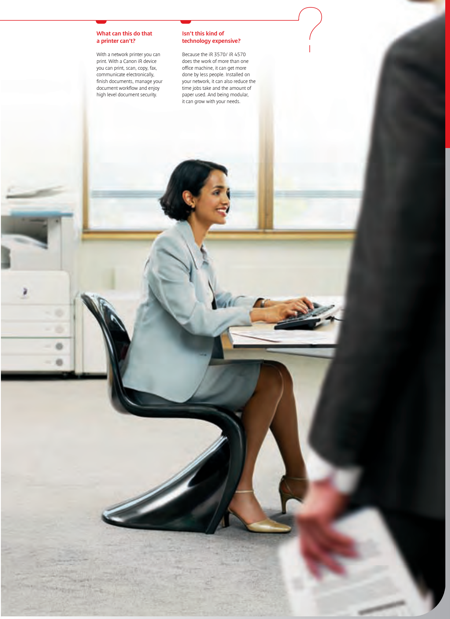
Black and white intelligence that supports you in the office